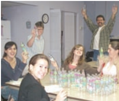
A group of volunteers prepare Baby Bottles to be given out in churches for folks to collect their change in and return.